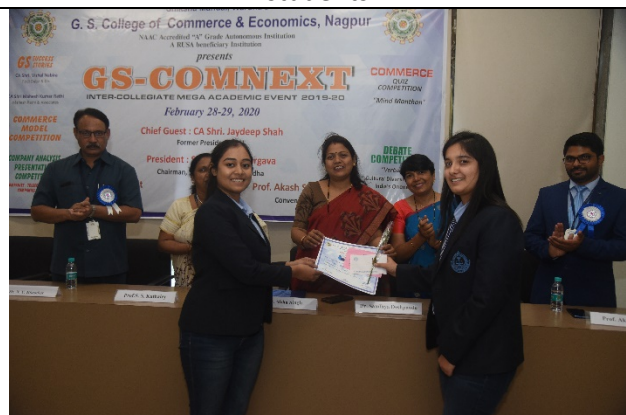
Debate Competition - Prize Distribution