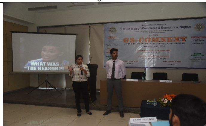
Students presenting during Company Analysis Competition