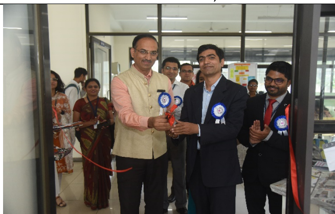
Inaugural of Commerce Model Competition