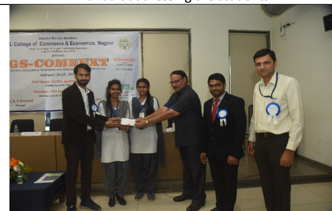
Company Analysis Competition - Prize Distribution