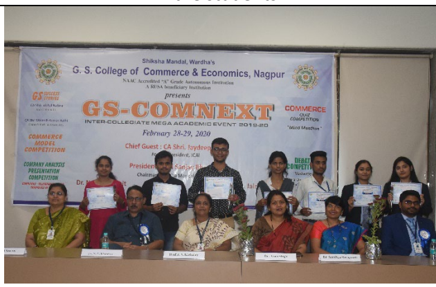
Debate Competition - Winners of Debate Competition