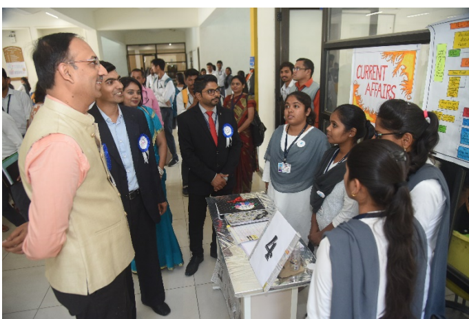
Guests interacting with students at News Room