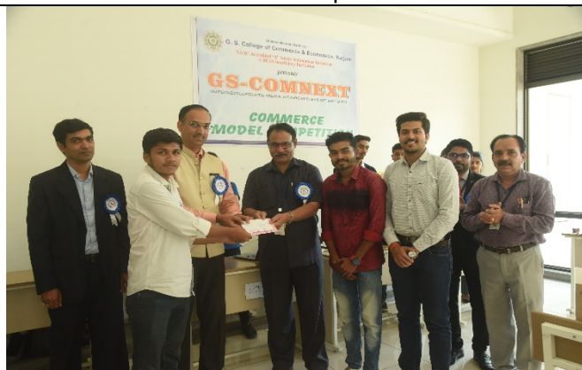
Commerce Model Competition - Prize Distribution