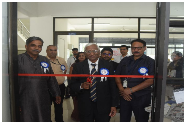
Inaugural of Commerce Model Exhibition