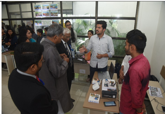
Commerce Model Competition - Students interaction with Chief Guest and Chairman, Shiksha Mandal