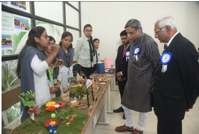
Commerce Model Competition - Students interaction with Chief Guest and Chairman, Shiksha Mandal