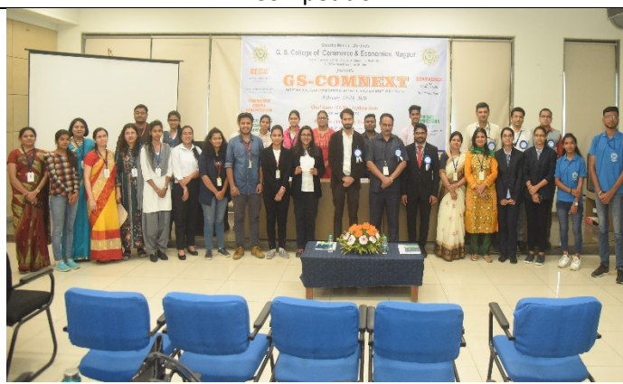
Company Analysis Competition - Winners of Company Analysis Competition