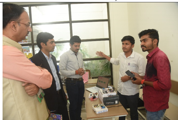
Student explaining Model to the judges