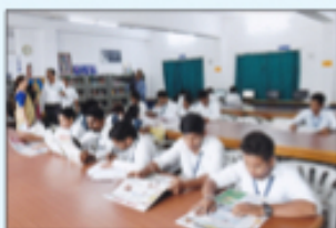
Library / Reading Room