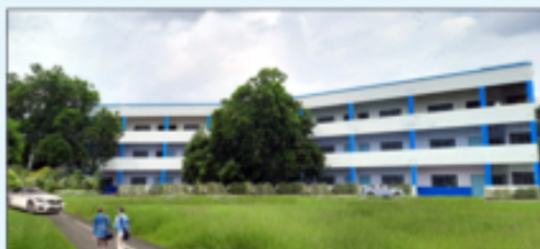
Platinum Jubilee / RUSA Building