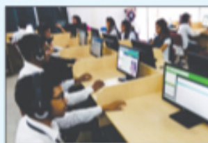
English Language Lab