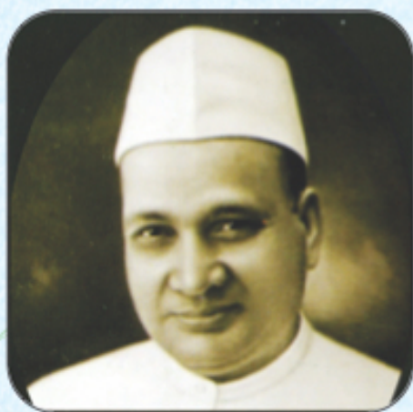
Shri Jamanalal Bajaj