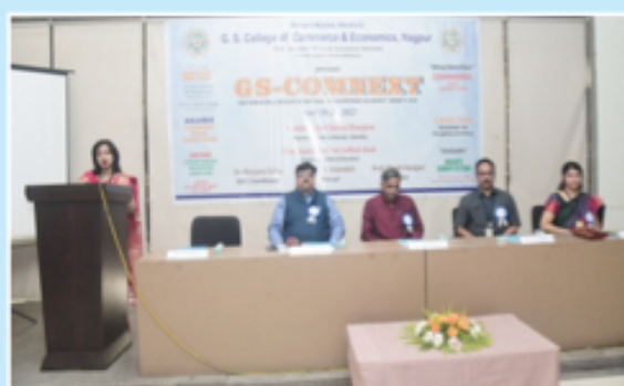
Guests at GS Connex