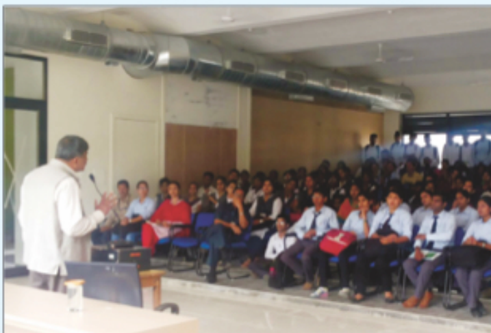
Seminar Hall (Bajaj Bhavan)