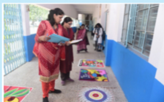
Guests at Umang