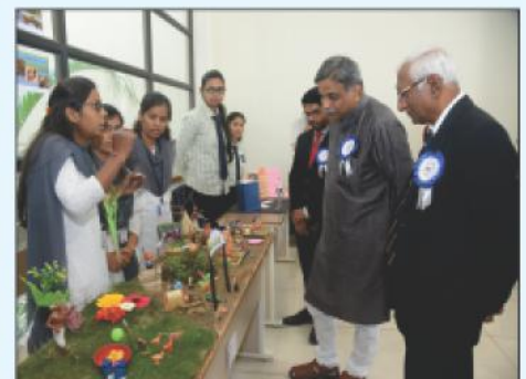
Commerce Model Exhibition: 2019-20