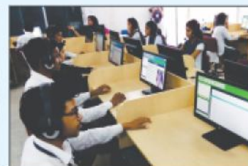
English Language Lab