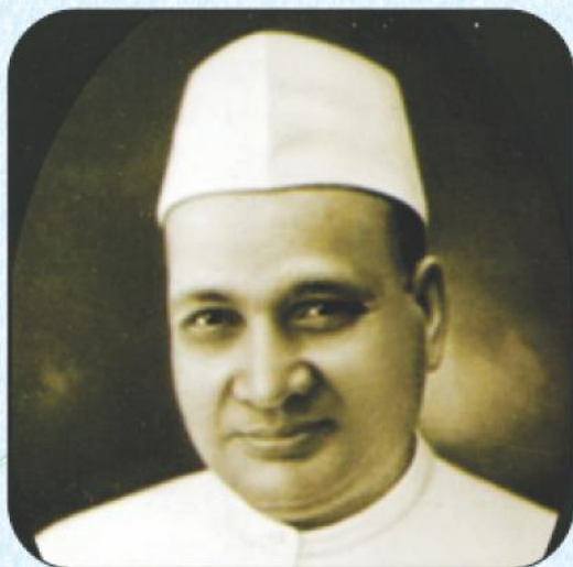
Shri Jamanalal Bajaj