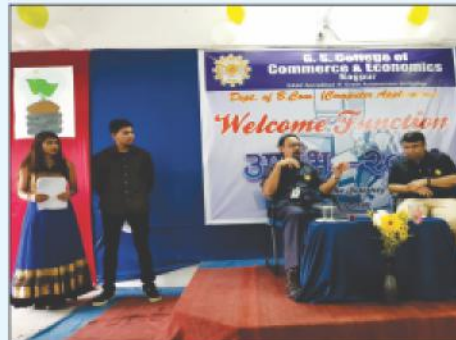
B.C.C.A. Arambh: 2019-20