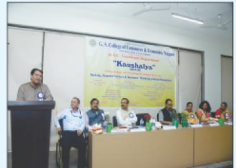
MCVC Workshop Kaushalya : 2019-20