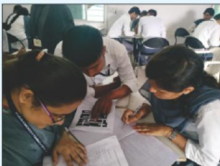
M.Com. Crossword Competition: 2019-20