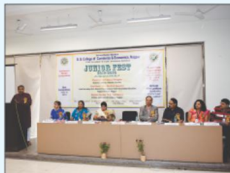
Junior Fest: 2019-20