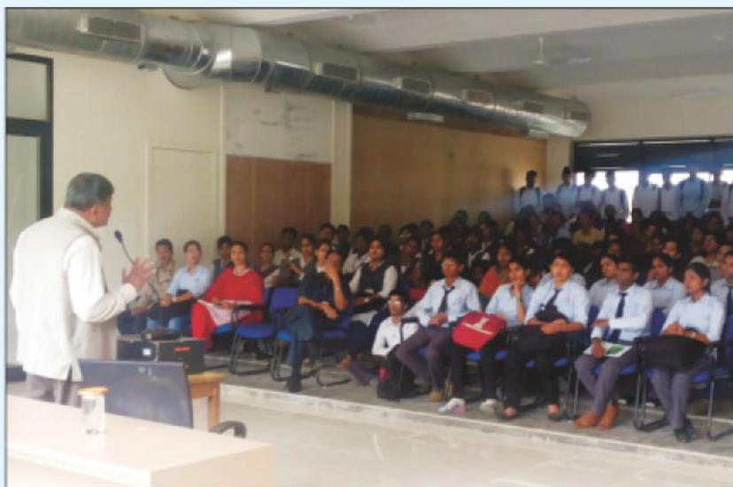
Seminar Hall (Bajaj Bhavan)