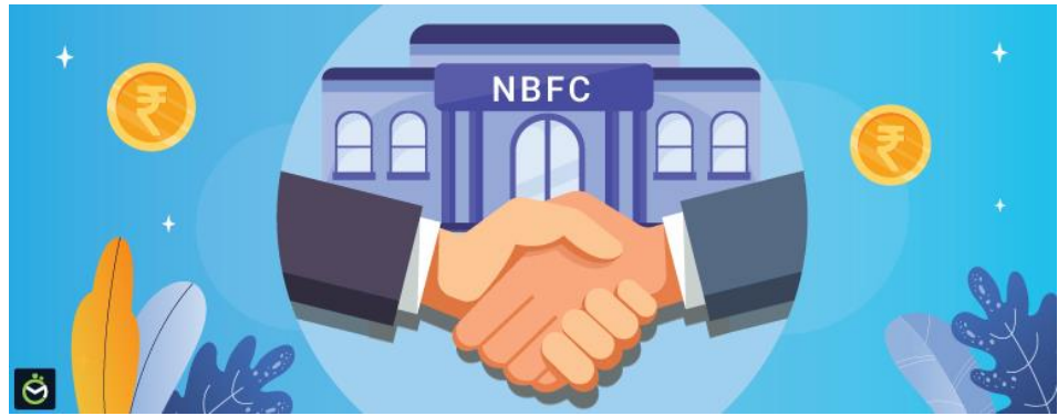
Top bank companies