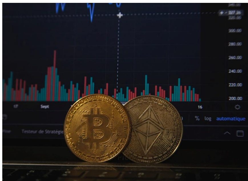
Background of website heading