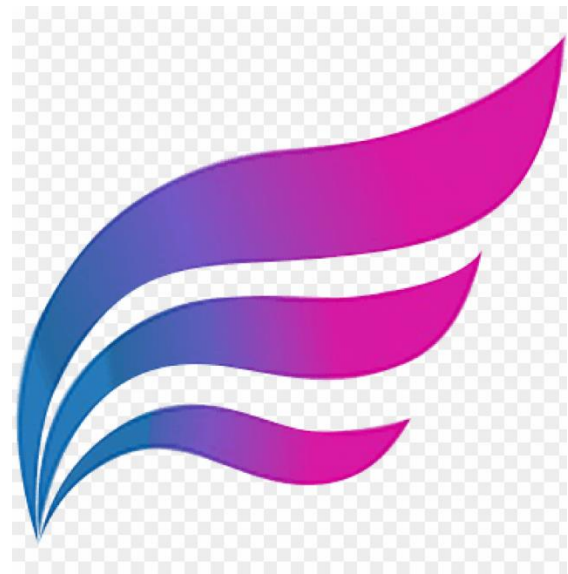
Logo of our website