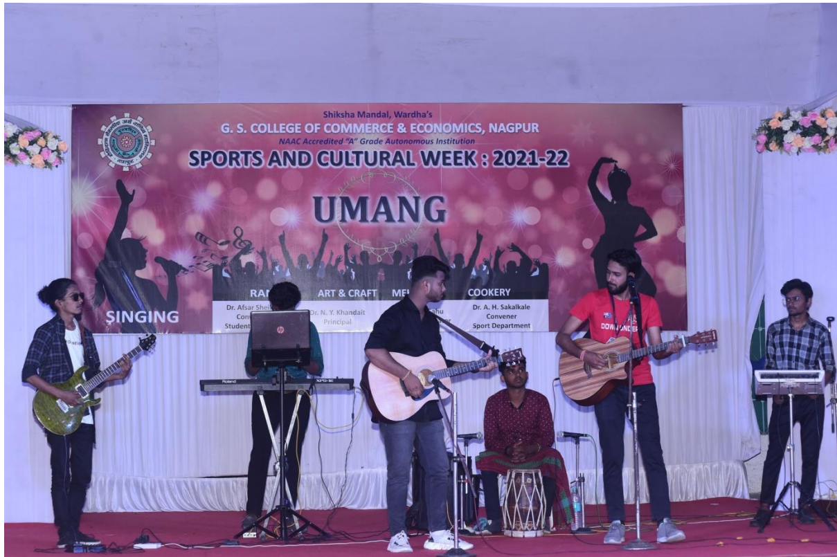
Students performing in singing competition