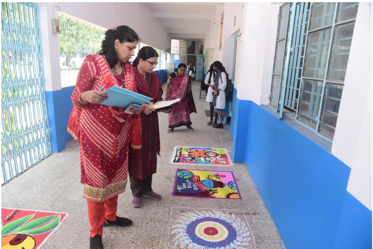
Judges at Rangoli competition