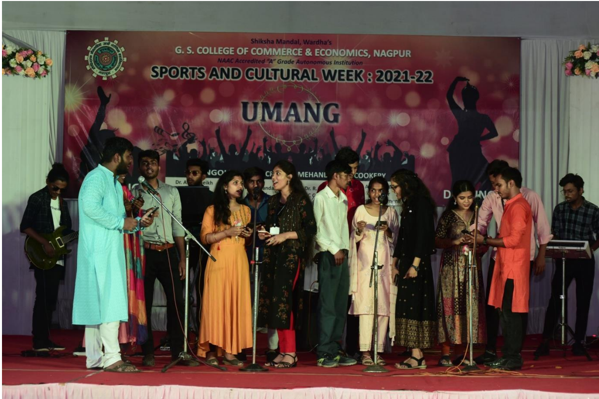
Student performing in group singing competition