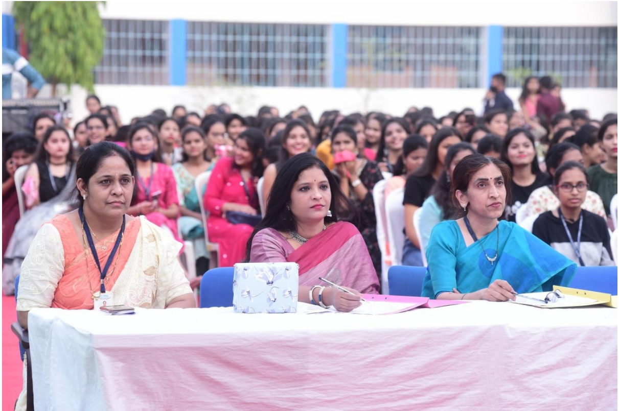
Judges of Dance competition judging the event