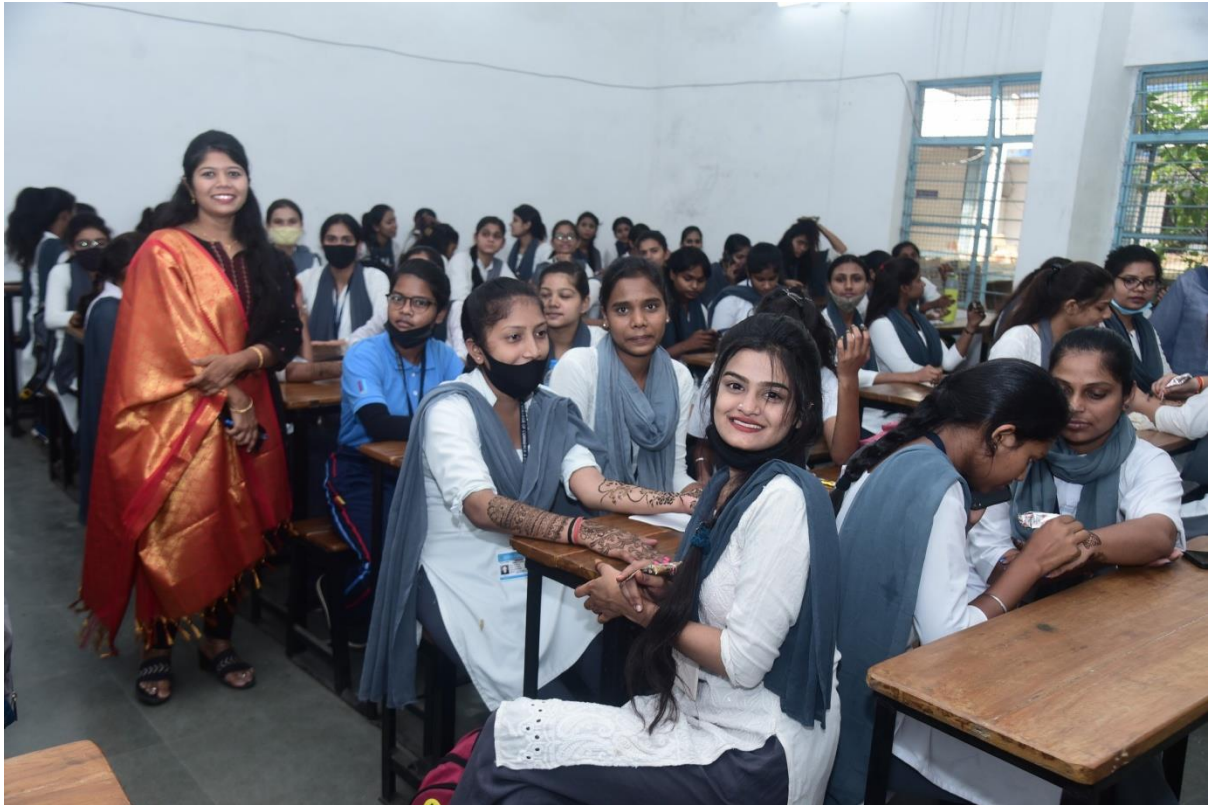
Students participating in Mehendi Competition