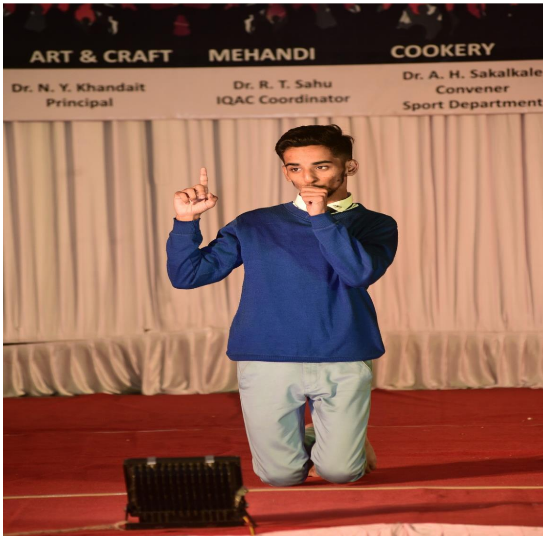
Student performing in solo dance competition