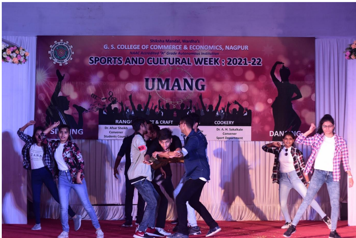
Students performing in group dance competition