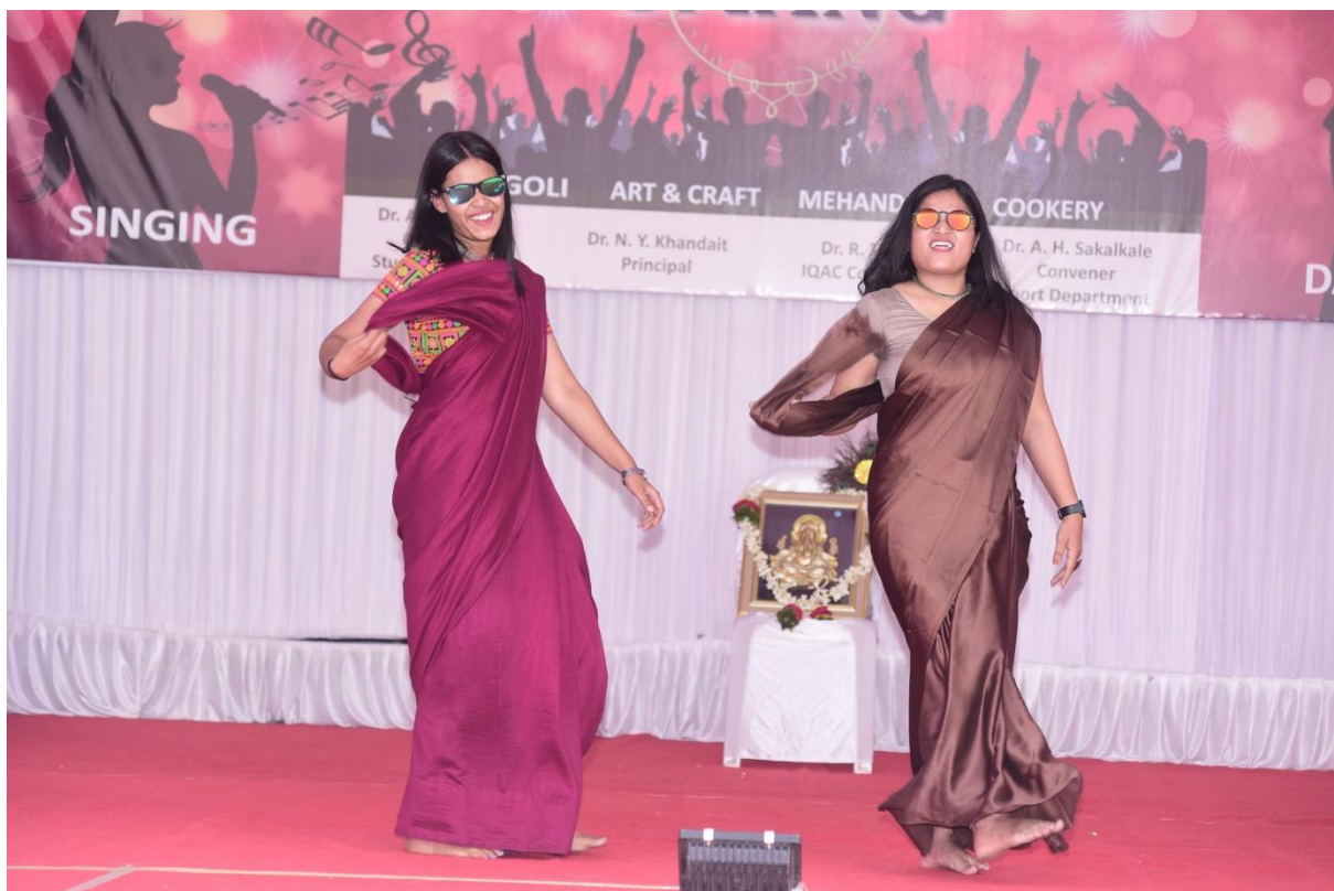
Students performing in group dance competition