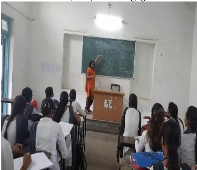
Remedial Class-I(Odd)-Class engagement