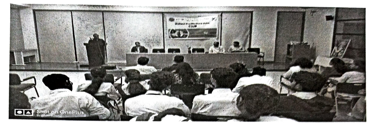
Inauguration Program of Ek Bharat Shrestha Bharat Club (EBSB)