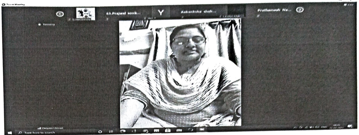
Maharashtra Day celebrated On-line mode: