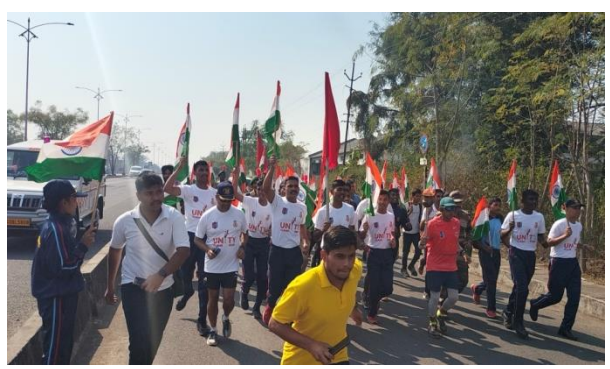
Unity Flame Run-Photos