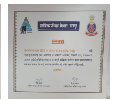
Walkathon Organised by RTO, Nagpur- Photos and Appreciation Certificate