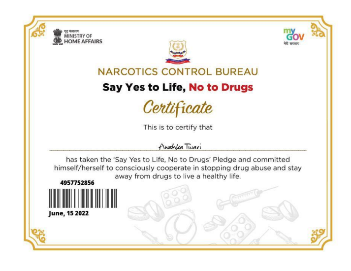
Say No To Drugs Online Pledge Certificate