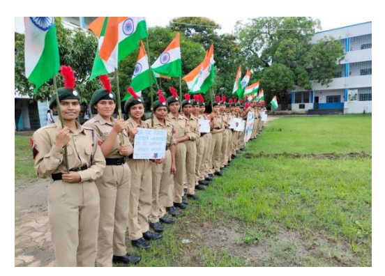
Celebration of Azadi Ka Amrut Mahotsava- Janda Rally, Poster Competition etc.