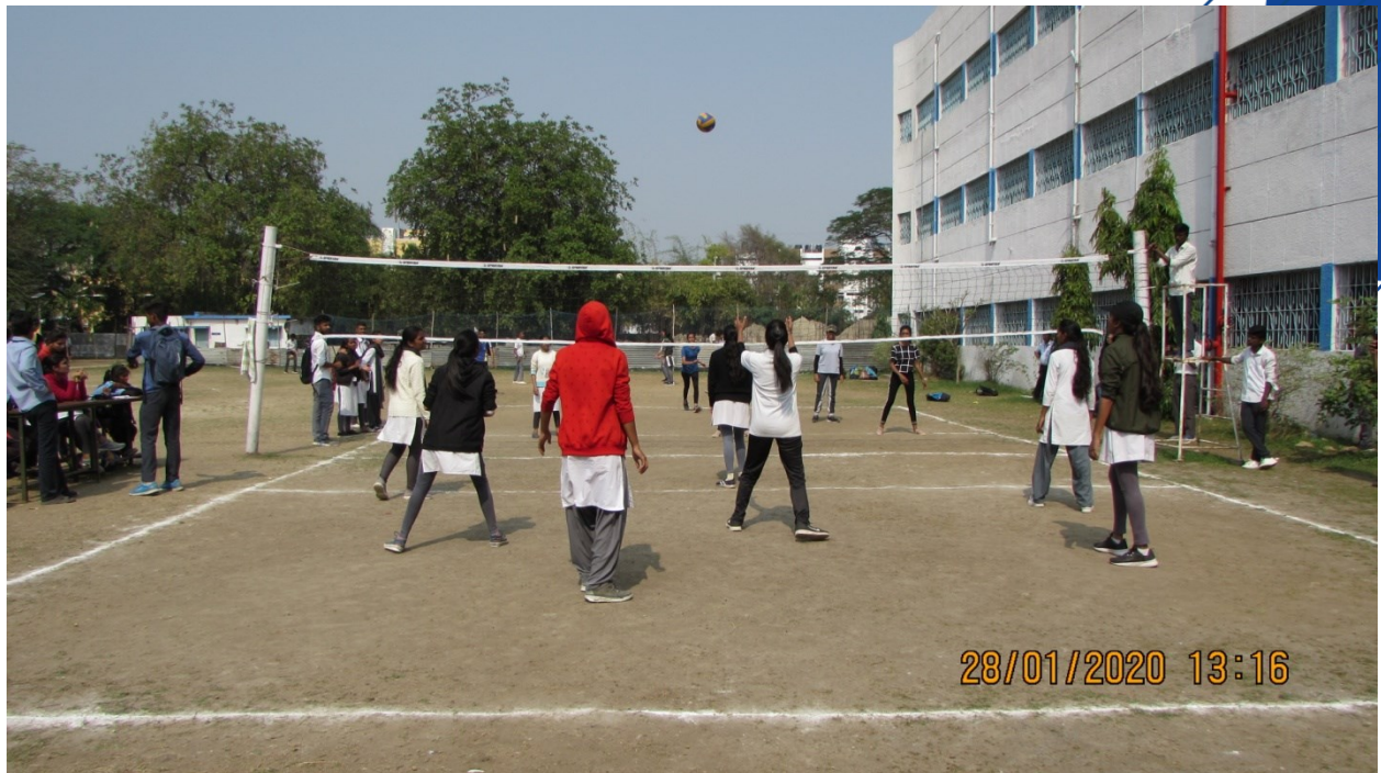
Tennikoit (Girls) Inter-class Final competition