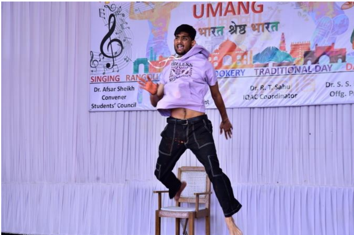
Student performing in Dance Competition