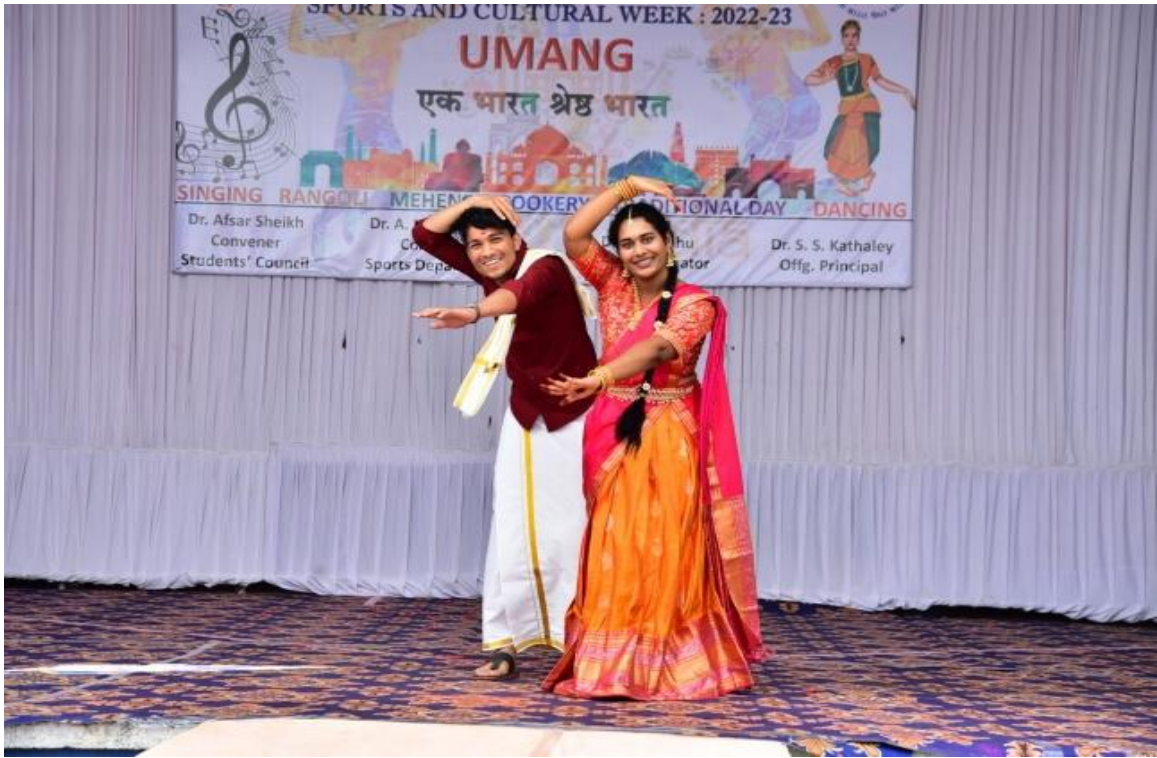
Students performing in Traditional Day Competition