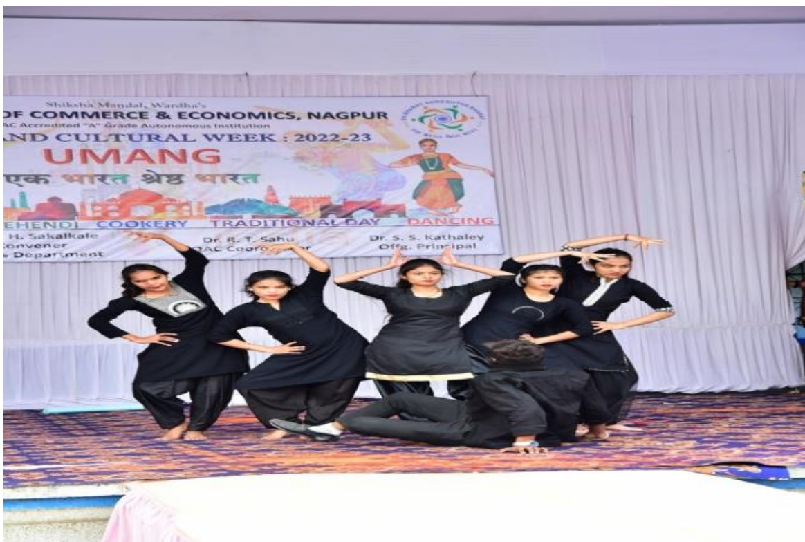
Students performing in Dance Competition