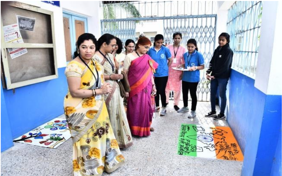
Judges at Rangoli Competition