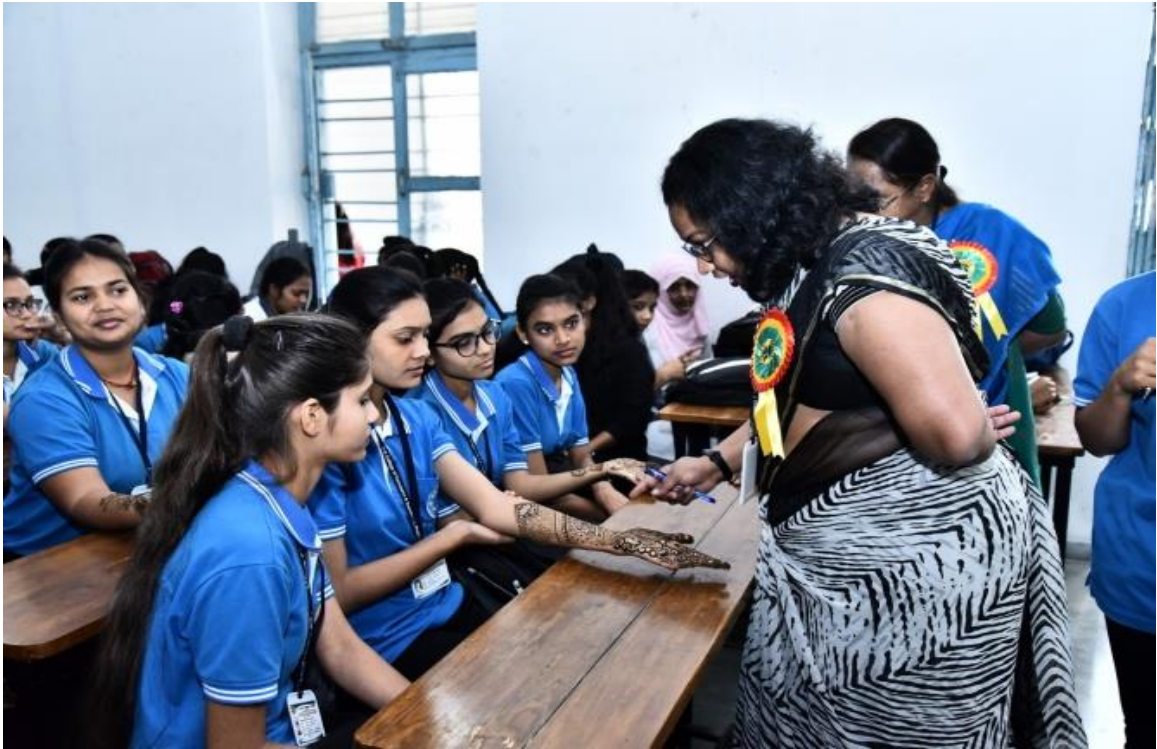
Judges at Mehandi Competition