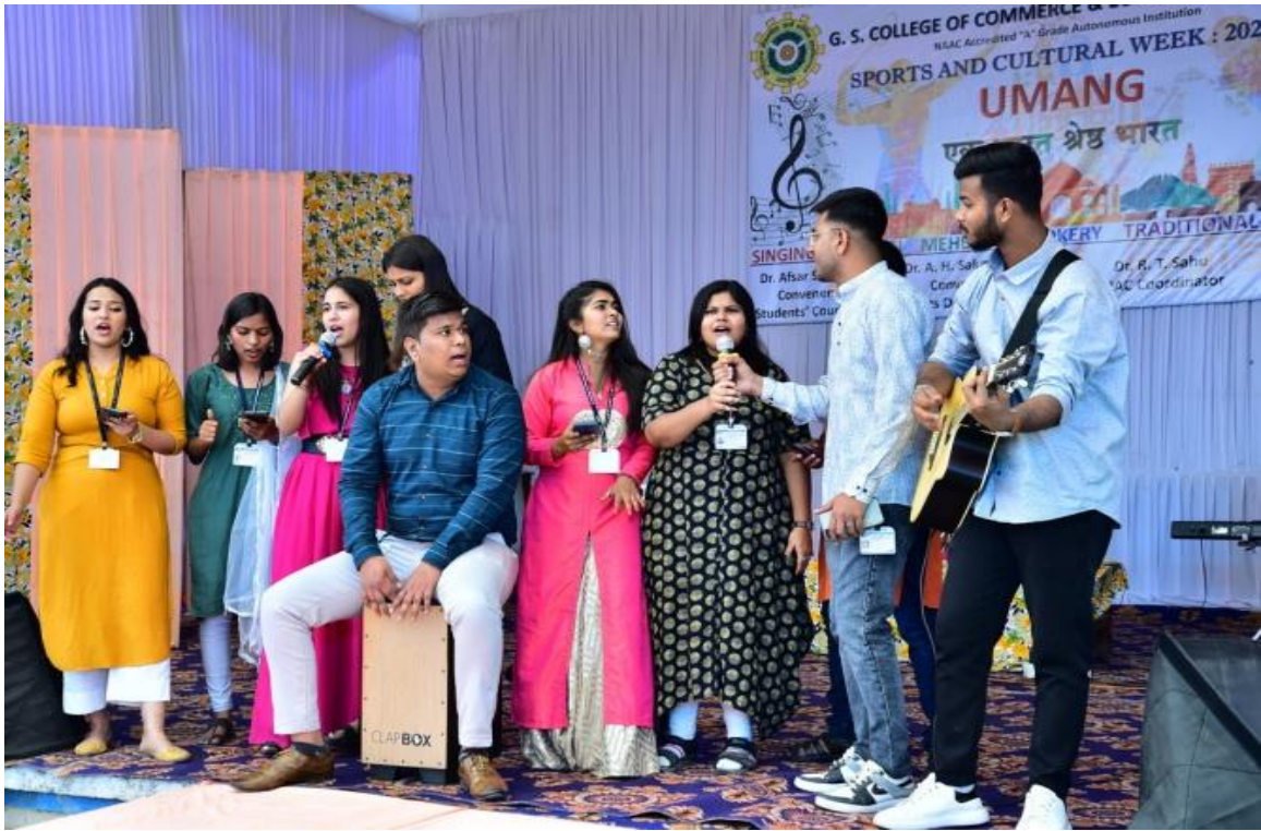
Students performing in Singing Competition