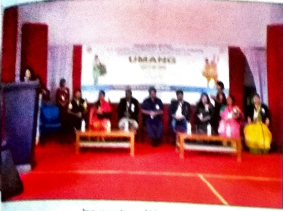
Inauguration of Umang