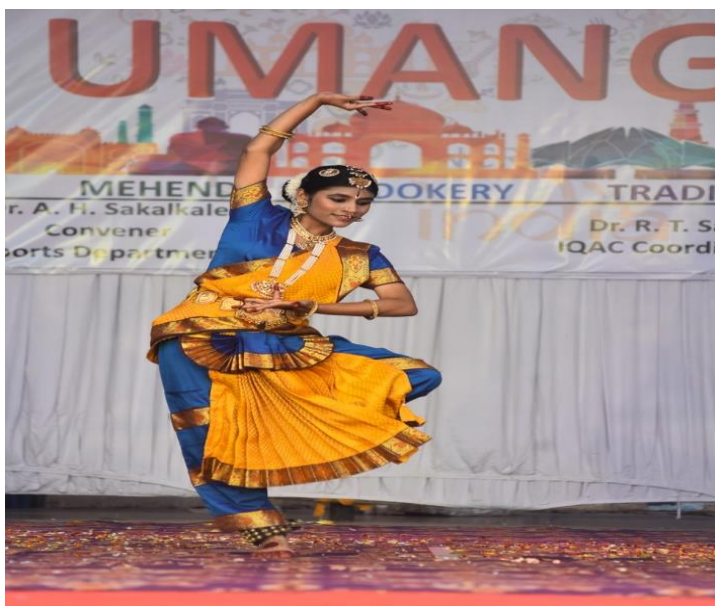
Solo Dance Competition