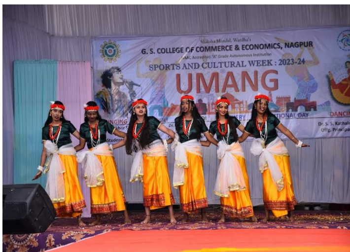
Group Dance Competition