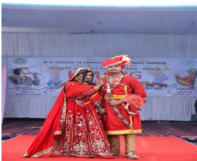
Traditional day competition