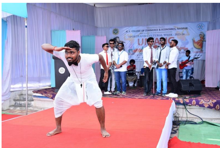
Group singing competition